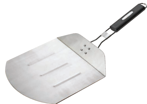
Additional Pizza Peels